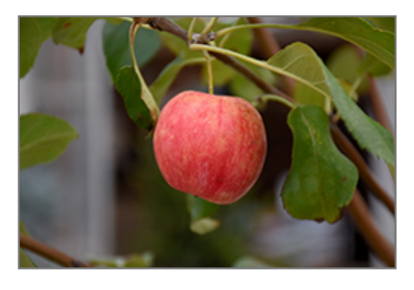
Rescue Apple-Crab fruit

Rescue Apple-Crab features showy clusters of lightly-scented white flowers with shell pink overtones along the branches in mid spring, which emerge from distinctive pink flower buds. It has forest green deciduous foliage. The pointy leaves turn yellow in fall. The fruits are showy red apples with hints of yellow, which are carried in abundance from mid summer to early fall. The fruit can be messy if allowed to drop on the lawn or walkways, and may require occasional clean-up.