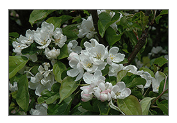
Rescue Apple-Crab flowers

* This is a 'special order' plant - contact store for details