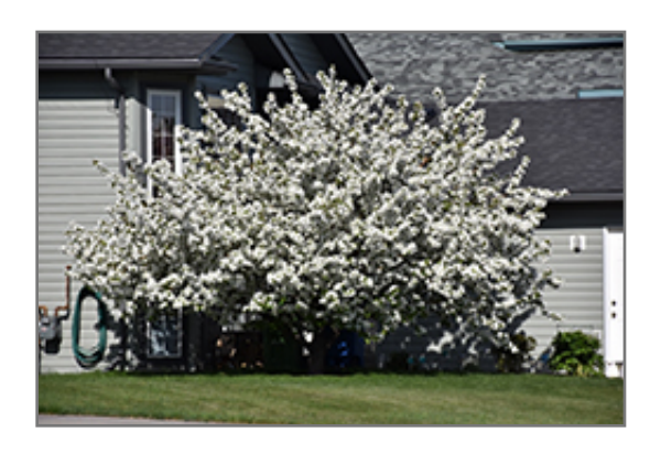
Rescue Apple-Crab in bloom