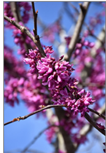
Eastern Redbud (tree form) flowers