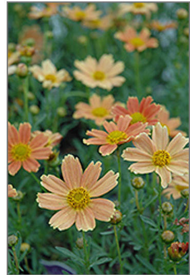
Sienna Sunset Tickseed flowers

Sienna Sunset Tickseed is recommended for the following landscape applications;