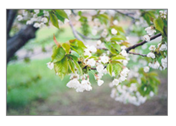
Van Cherry flowers