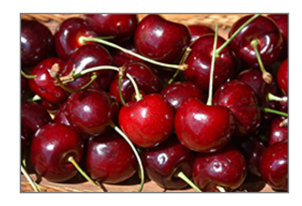
Van Cherry fruit

Van Cherry is draped in stunning clusters of fragrant white flowers hanging below the branches in early spring before the leaves. It has dark green deciduous foliage. The pointy leaves turn yellow in fall. The fruits are showy dark red drupes with deep purple overtones, which are carried in abundance in mid summer. The fruit can be messy if allowed to drop on the lawn or walkways, and may require occasional clean-up. The smooth dark red bark adds an interesting dimension to the landscape.