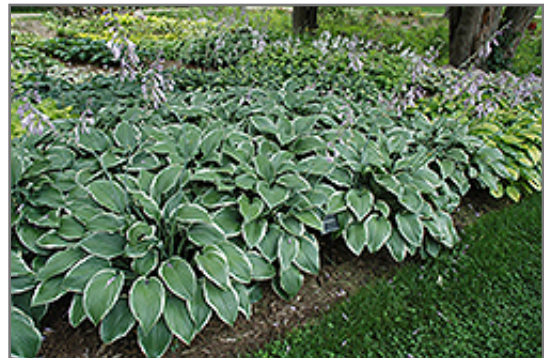
Winter Snow Hosta in bloom