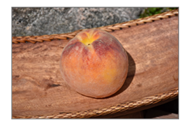
Suncrest Peach fruit