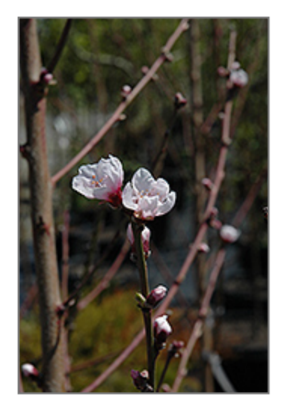
Suncrest Peach flowers