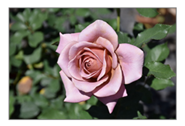
Koko Loko Rose flowers

Koko Loko Rose is recommended for the following landscape applications;