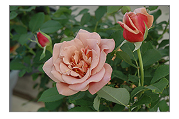
Koko Loko Rose flowers