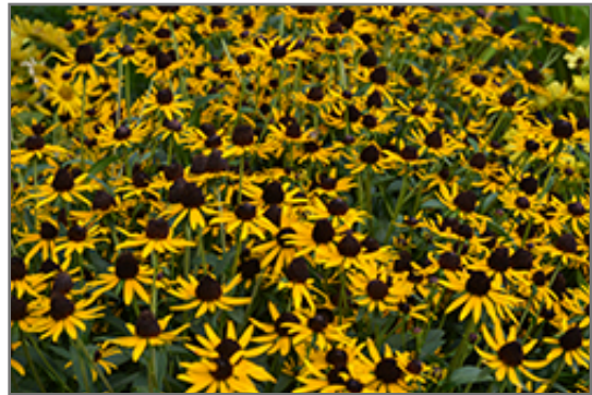
Little Goldstar Coneflower flowers