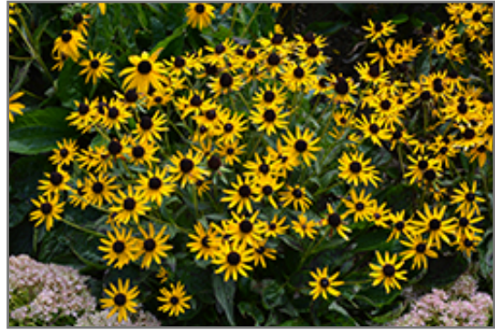
Little Goldstar Coneflower in bloom

This is a relatively low maintenance plant, and should be cut back in late fall in preparation for winter. It is a good choice for attracting butterflies to your yard, but is not particularly attractive to deer who tend to leave it alone in favor of tastier treats. It has no significant negative characteristics.