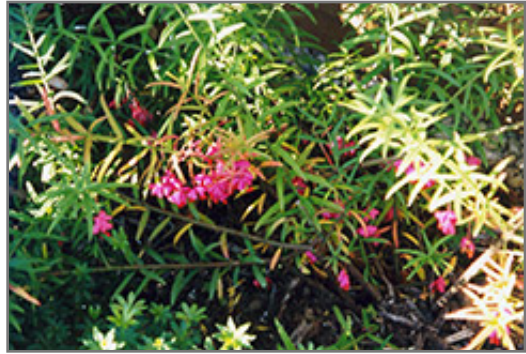
Dwarf Turkestan Burning Bush flowers

This shrub performs well in both full sun and full shade. It is very adaptable to both dry and moist locations, and should do just fine under typical garden conditions. It is not particular as to soil type or pH. It is highly tolerant of urban pollution and will even thrive in inner city environments. This is a selected variety of a species not originally from North America.