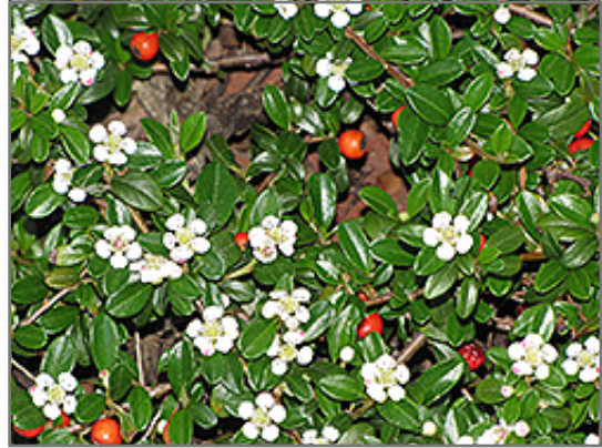
Coral Beauty Cotoneaster fruit

Coral Beauty Cotoneaster will grow to be about 12 inches tall at maturity, with a spread of 5 feet. It tends to fill out right to the ground and therefore doesn't necessarily require facer plants in front. It grows at a fast rate, and under ideal conditions can be expected to live for approximately 30 years.