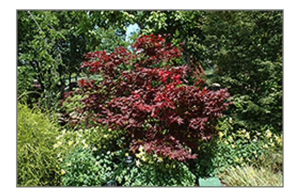
Okagami Japanese Maple