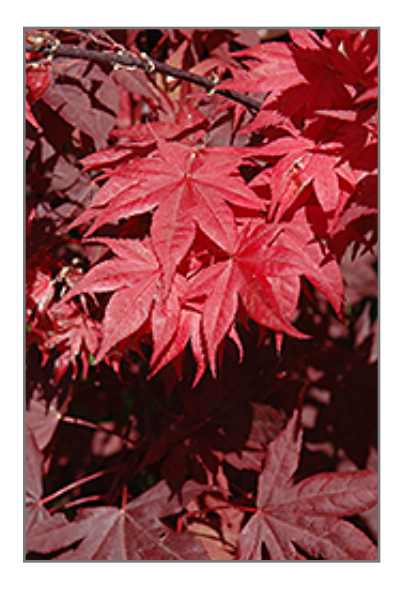
Okagami Japanese Maple foliage