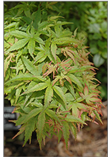
Sharp's Pygmy Japanese Maple foliage