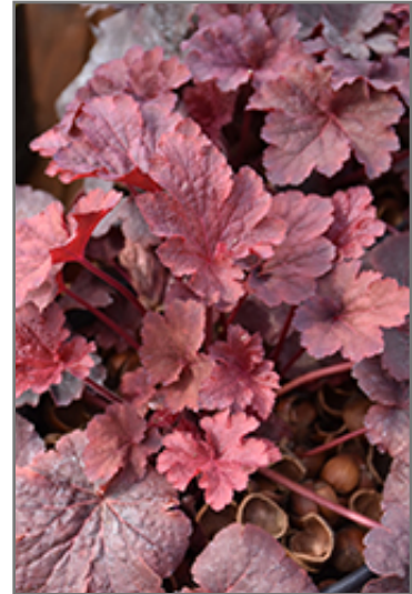
Cajun Fire Coral Bells foliage

Cajun Fire Coral Bells is recommended for the following landscape applications;