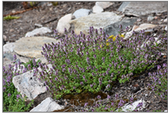
Lemon Thyme in bloom

This plant is quite ornamental as well as edible, and is as much at home in a landscape or flower garden as it is in a designated herb garden. It should only be grown in full sunlight. It prefers to grow in average to dry locations, and dislikes excessive moisture. It is considered to be drought-tolerant, and thus makes an ideal choice for a low-water garden or xeriscape application. It is not particular as to soil type or pH. It is highly tolerant of urban pollution and will even thrive in inner city environments. Consider covering it with a thick layer of mulch in winter to protect it in exposed locations or colder microclimates. This particular variety is an interspecific hybrid. It can be propagated by division; however, as a cultivated variety, be aware that it may be subject to certain restrictions or prohibitions on propagation.