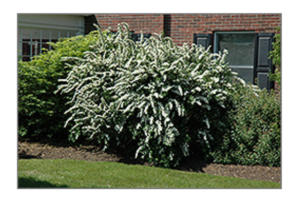
Renaissance Spirea in bloom