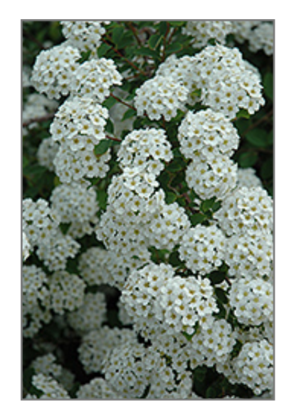
Renaissance Spirea flowers