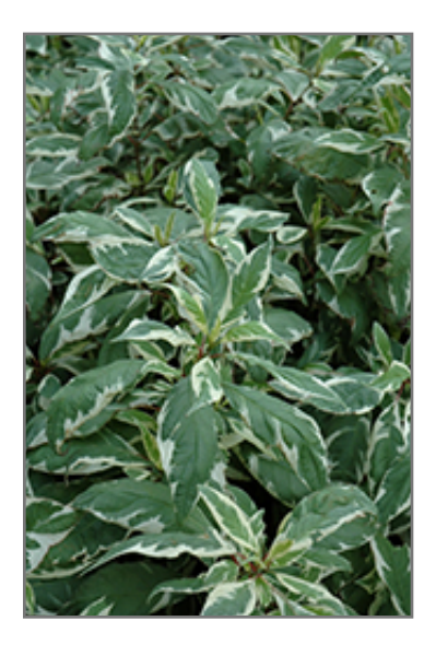
Cream Cracker Dogwood foliage

Cream Cracker Dogwood is a multi-stemmed deciduous shrub with a more or less rounded form. Its average texture blends into the landscape, but can be balanced by one or two finer or coarser trees or shrubs for an effective composition.