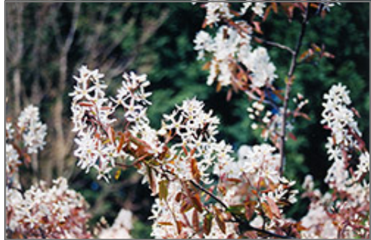
Cole's Select Serviceberry flowers