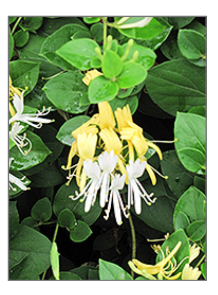
Hall's Japanese Honeysuckle flowers