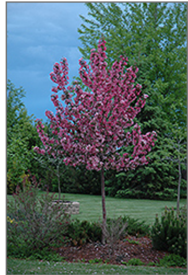
Rudolph Flowering Crab in bloom

Rudolph Flowering Crab is recommended for the following landscape applications;