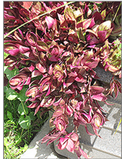
Purple Wandering Jew

Purple Wandering Jew is recommended for the following landscape applications;