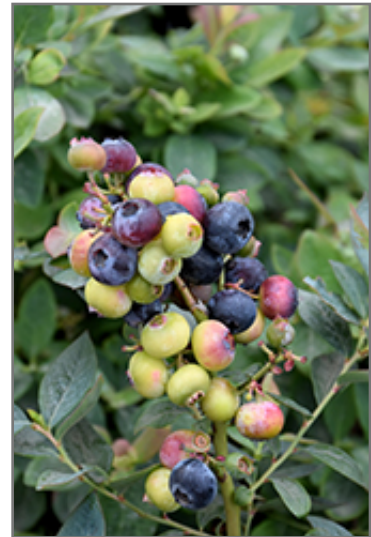
Pink Icing Blueberry fruit

This is a multi-stemmed deciduous shrub with an upright spreading habit of growth. Its relatively fine texture sets it apart from other landscape plants with less refined foliage. This is a relatively low maintenance plant, and usually looks its best without pruning, although it will tolerate pruning. It is a good choice for attracting birds to your yard. It has no significant negative characteristics.