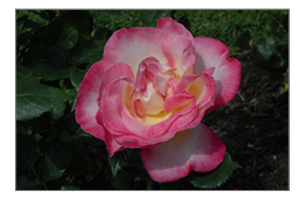
California Dreamin' Rose flowers