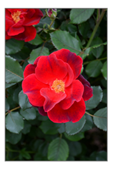
Miracle On The Hudson Rose flowers