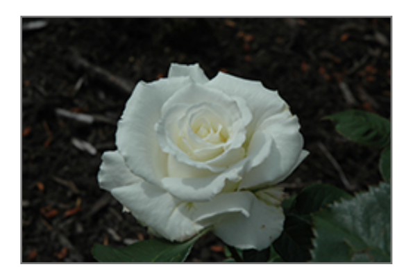
White Lightnin' Rose flowers