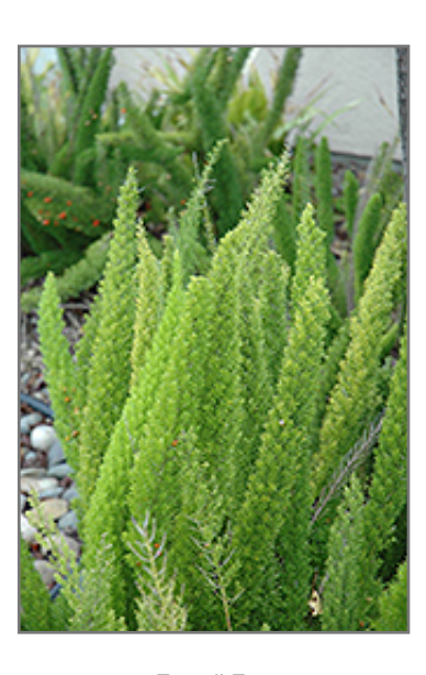
Foxtail Fern

When grown indoors, Foxtail Fern can be expected to grow to be about 24 inches tall at maturity, with a spread of 24 inches. It grows at a medium rate, and under ideal conditions can be expected to live for approximately 15 years. This houseplant will do well in a location that gets either direct or indirect sunlight, although it will usually require a more brightly-lit environment than what artificial indoor lighting alone can provide. It does best in average to evenly moist soil, but will not tolerate standing water. The surface of the soil shouldn't be allowed to dry out completely, and so you should expect to water this plant once and possibly even twice each week. Be aware that your particular watering schedule may vary depending on its location in the room, the pot size, plant size and other conditions; if in doubt, ask one of our experts in the store for advice. It is not particular as to soil pH, but grows best in rich soil. Contact the store for specific recommendations on pre-mixed potting soil for this plant.