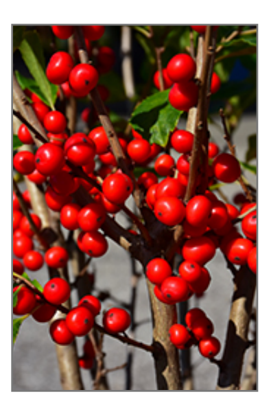
Little Goblin Red Winterberry fruit