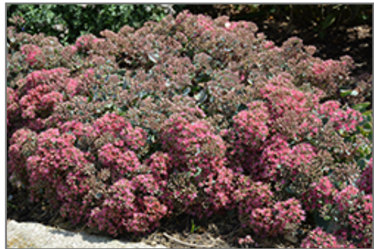
Popstar Stonecrop in bloom