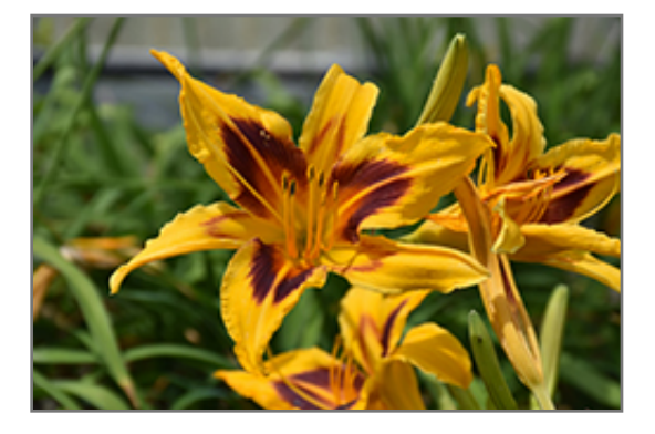
Bonanza Daylily flowers