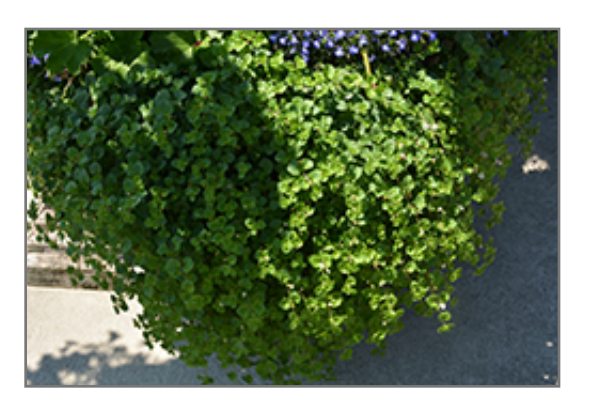
Snowstorm Blue Bubbles Bacopa foliage