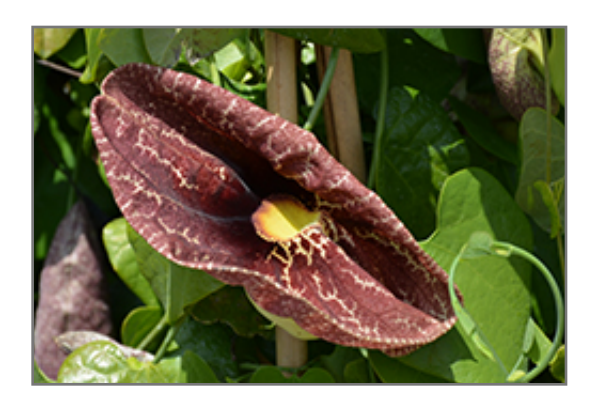
Giant Dutchman's Pipe flowers