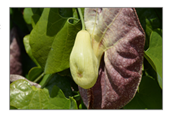
Giant Dutchman's Pipe flowers

This woody vine does best in full sun to partial shade. It prefers to grow in average to moist conditions, and shouldn't be allowed to dry out. It is not particular as to soil type or pH. It is highly tolerant of urban pollution and will even thrive in inner city environments. This species is not originally from North America.