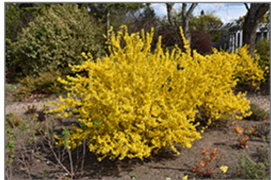
Magical Gold Forsythia in bloom