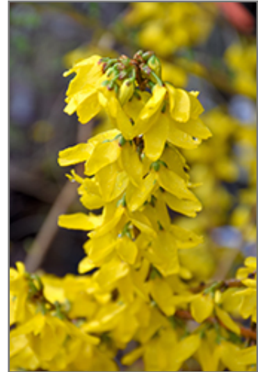
Magical Gold Forsythia flowers

* This is a 'special order' plant - contact store for details