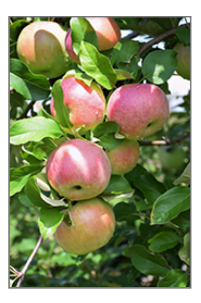
Northern Spy Apple fruit