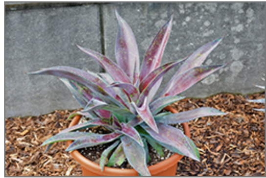
Mission to Mars Mangave

Mission to Mars Mangave will grow to be about 10 inches tall at maturity, with a spread of 22 inches. It grows at a fast rate, and under ideal conditions can be expected to live for approximately 5 years. As an herbaceous perennial, this plant will usually die back to the crown each winter, and will regrow from the base each spring. Be careful not to disturb the crown in late winter when it may not be readily seen!