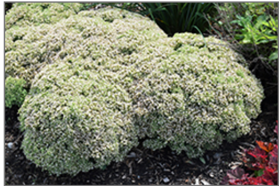
Rock 'N Round Bundle Of Joy Stonecrop in bloom

This is a relatively low maintenance plant, and is best cleaned up in early spring before it resumes active growth for the season. It is a good choice for attracting bees and butterflies to your yard, but is not particularly attractive to deer who tend to leave it alone in favor of tastier treats. It has no significant negative characteristics.