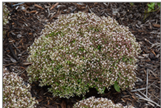
Rock 'N Round Bundle Of Joy Stonecrop in bloom