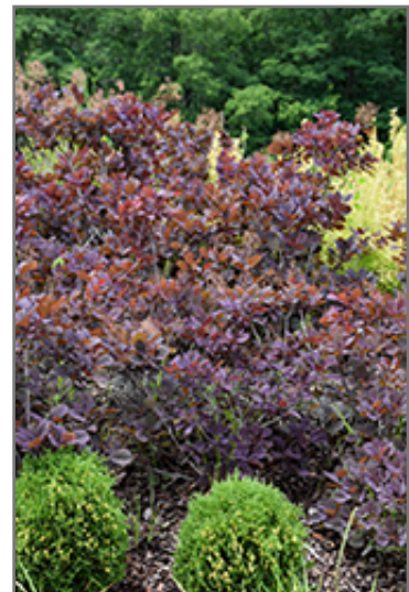
Velveteeny Purple Smokebush