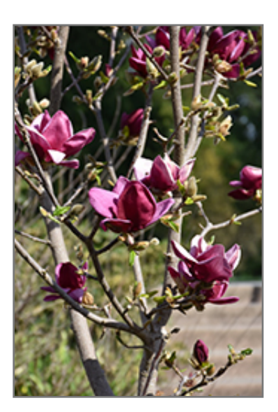
Genie Magnolia flowers