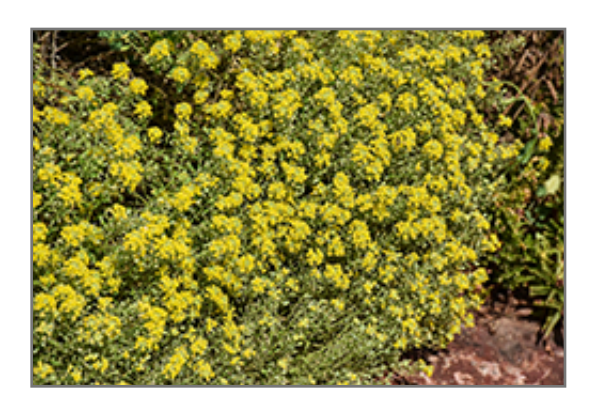
Mountain Alyssum flowers