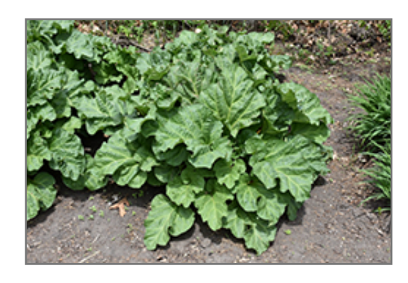
Crimson Red Rhubarb

Crimson Red Rhubarb is primarily valued in the landscape or garden for its pronouncedly upright and towering form. It features bold spikes of creamy white flowers rising above the foliage from late spring to early summer. Its attractive large crinkled lobed leaves emerge chartreuse in spring, turning dark green in colour throughout the season. The crimson stems are very colorful and add to the overall interest of the plant.