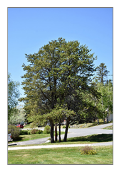
Jack Pine

Jack Pine will grow to be about 45 feet tall at maturity, with a spread of 35 feet. It has a low canopy with a typical clearance of 4 feet from the ground, and should not be planted underneath power lines. It grows at a slow rate, and under ideal conditions can be expected to live for 80 years or more.