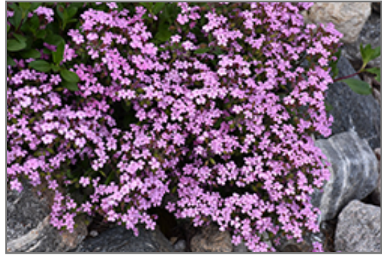
Rock Soapwort in bloom