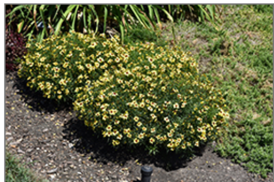
Sizzle And Spice Sassy Saffron Tickseed in bloom