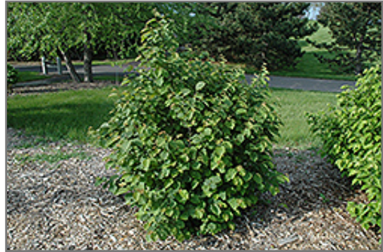
Beaked Hazelnut

Beaked Hazelnut will grow to be about 8 feet tall at maturity, with a spread of 7 feet. It tends to be a little leggy, with a typical clearance of 2 feet from the ground, and is suitable for planting under power lines. It grows at a medium rate, and under ideal conditions can be expected to live for approximately 30 years. While it is considered to be somewhat self-pollinating, it tends to set heavier quantities of fruit with a different variety of the same species growing nearby.