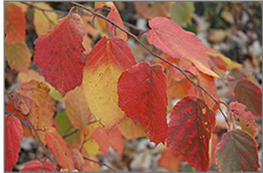
Beaked Hazelnut in fall

This is a multi-stemmed deciduous shrub with an upright spreading habit of growth. Its average texture blends into the landscape, but can be balanced by one or two finer or coarser trees or shrubs for an effective composition. This plant will require occasional maintenance and upkeep, and can be pruned at anytime. It is a good choice for attracting squirrels to your yard. Gardeners should be aware of the following characteristic(s) that may warrant special consideration;