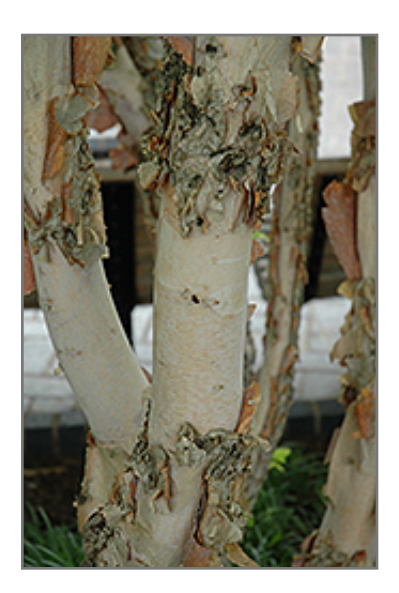
Fox Valley River Birch bark