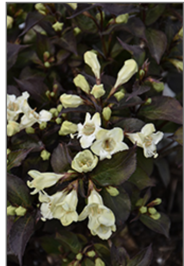
Wine & Spirits Weigela flowers