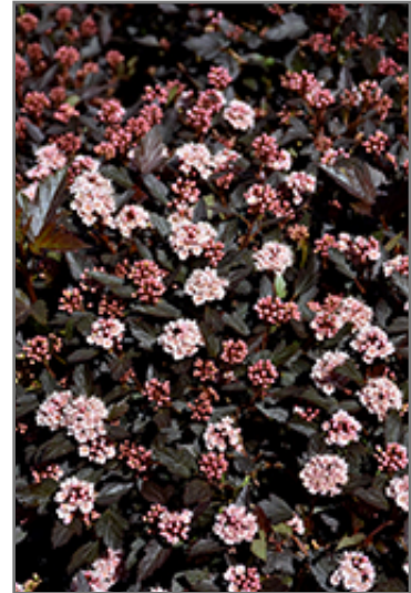
Little Joker Ninebark flowers