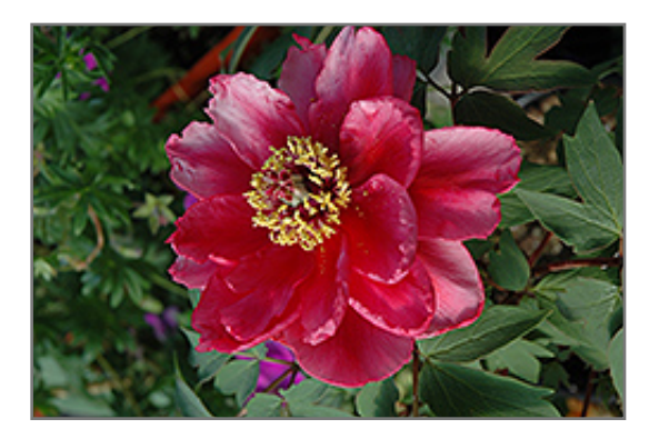
Shimanishiki Tree Peony flowers