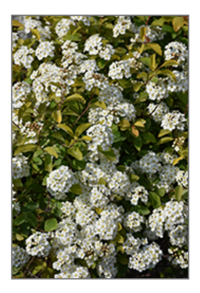
Firegold Spirea flowers