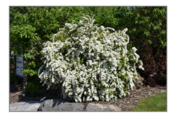
Firegold Spirea in bloom

This is a relatively low maintenance shrub, and should only be pruned after flowering to avoid removing any of the current season's flowers. It is a good choice for attracting butterflies to your yard, but is not particularly attractive to deer who tend to leave it alone in favor of tastier treats. It has no significant negative characteristics.