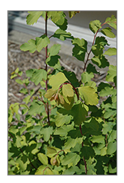
Firegold Spirea foliage

This shrub should only be grown in full sunlight. It prefers to grow in average to moist conditions, and shouldn't be allowed to dry out. It is not particular as to soil type or pH. It is highly tolerant of urban pollution and will even thrive in inner city environments. This particular variety is an interspecific hybrid.