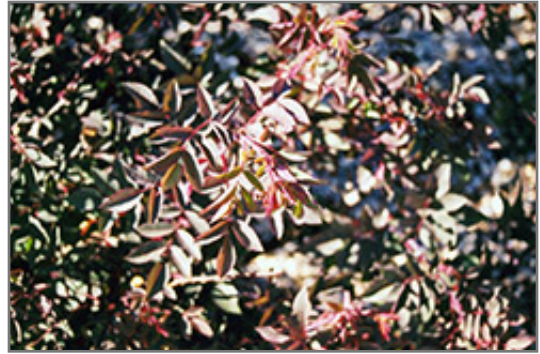
Red Leaf Rose foliage

This shrub should only be grown in full sunlight. It does best in average to evenly moist conditions, but will not tolerate standing water. It is not particular as to soil type or pH. It is highly tolerant of urban pollution and will even thrive in inner city environments. This species is not originally from North America.