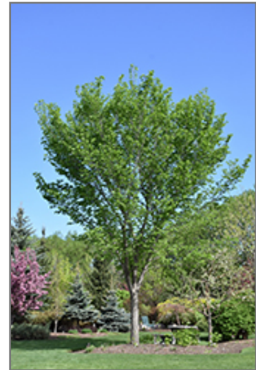
Brandon Elm