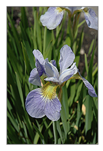
Sky Wings Siberian Iris flowers